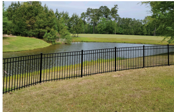
ALUMINUM FENCE STYLE

Note: Wooden fence is correct style in photo, stain is reflected in the square swatch.