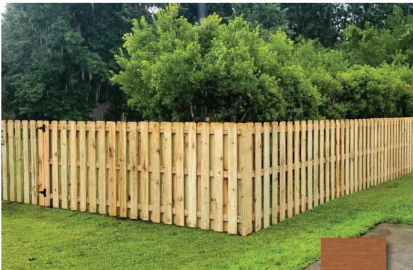
PRIVACY FENCE STYLE