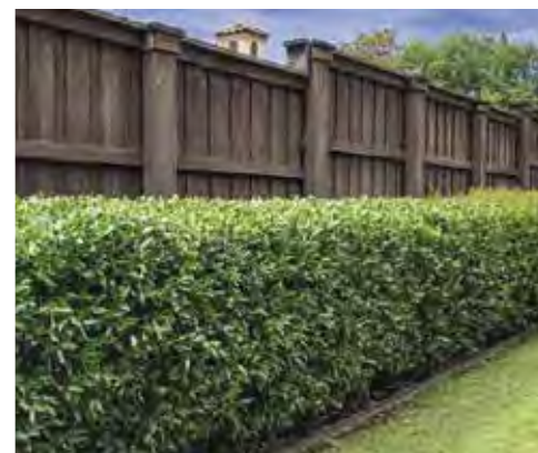
Hedge along fence