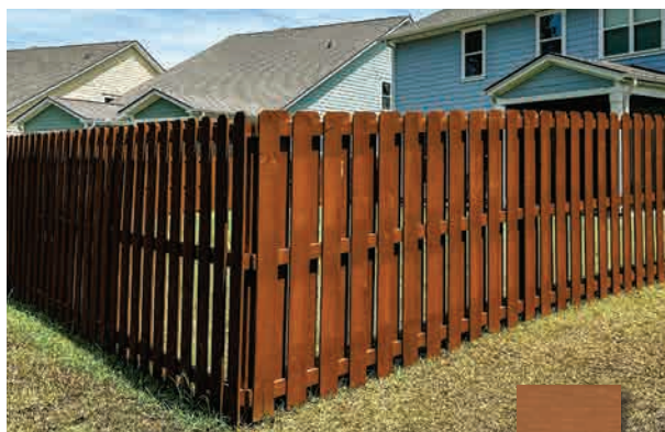
PRIVACY FENCE STYLE

Note: Wooden fence is correct style in photo, stain is reflected in the square swatch.