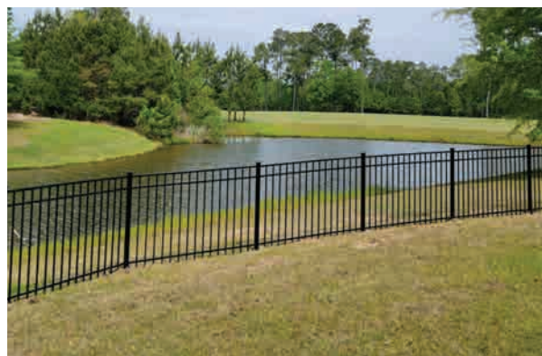
ALUMINUM FENCE STYLE